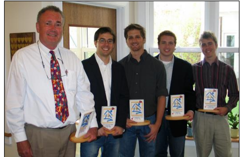
The Bowdoin College class team that developed a volunteer scheduling tool for the Ronald McDonald House in Portland, Maine in 2008.